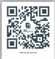
Scan here for the AR exhibition