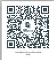
Scan here for the virtual heritage gallery