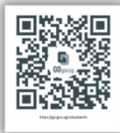
Anti-Drug Advocate Programme for youths aged 17 - 25 years old

Scan below to find out about the Augmented Reality exhibition and the Virtual Heritage Gallery that you can access at your convenience. Access PDE resources from our PDE Handbook online :