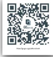
Scan here for the PDE Handbook

Drop us an email at CNB_Community_Partnership@cnb.gov.sg if you would like to unsubscribe or add your colleagues into our mailing list!