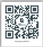
Scan here to find out about the A3 Network and different advocates schemes

Help us grow the A3 Network by telling your friends about us and the volunteering opportunities with CNB. Scan the QR codes for more information about the different schemes, or drop us an email at cnb_community_partnership@cnb.gov.sg