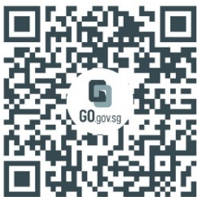
Facebook Post by Minister for Home Affairs and Law Mr K Shanmugam (1st Sept, 2022)

As advocates, it is helpful and important to clarify misunderstandings on how drug abuse and drug trafficking are managed in Singapore. Singapore’s drug-control strategy is targeted at reducing both drug supply and demand. We adopt a comprehensive harm prevention strategy, comprising Preventive Drug Education, Local and International Engagement, Firm Laws and Rigorous Enforcement, and Structured Rehabilitation and Aftercare Programmes.