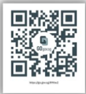
Scan here to find out about the A3 Network and different advocates schemes

Help us grow the A3 Network by telling your friends about us and the volunteering opportunities with CNB. Scan the QR codes for more information about the different schemes, or drop us an email at cnb_community_partnership@cnb.gov.sg