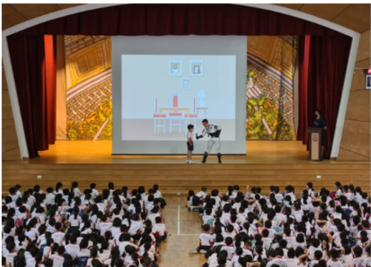
'Three's A Crowd', a skit for primary school students conducted at Princess Elizabeth Primary School