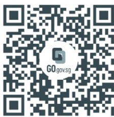
‘Are drugs really that bad?’ Former addict says conversation about drugs in S’pore no longer black & white

As part of efforts to spark conversations, NCADA has launched a new media campaign titled “What’s Your Fix?”. ‘What’s Your Fix?’ is a two-year campaign which aims to ignite meaningful conversations on the lived realities of drugs, and raise awareness on how members of society, especially youths, can be advocates for the anti-drug vision as well as support those who may be vulnerable to the influence of drugs. The campaign kicks off with a TikTok-exclusive series called ‘Finding Juliana’, which advocates can watch with family and friends as a starting point for deeper conversation. The series episodes and Hero Film is available on the campaign microsite.