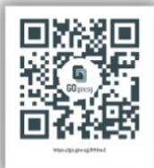
Scan here to find out about the A3 Network and different advocates schemes

Help us grow the A3 Network by telling your friends about us and the volunteering opportunities with CNB. Scan the QR codes for more information about the different schemes, or drop us an email at cnb_community_partnership@cnb.gov.sg