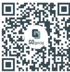
CNB Annual Statistics 2021