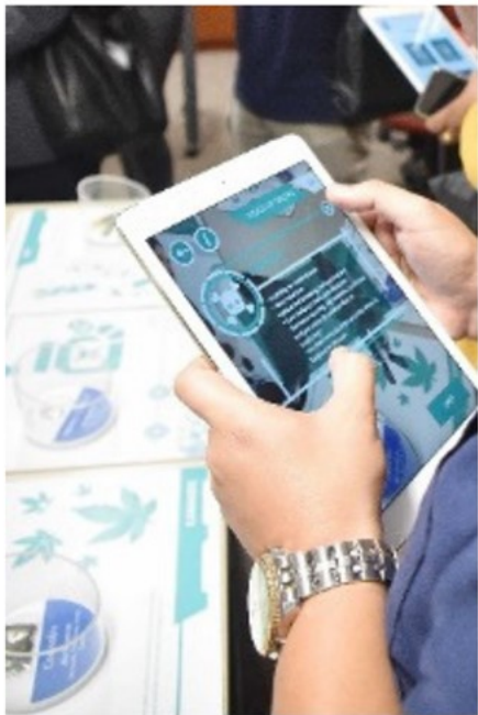
Augmented Reality (AR) Exhibition

Looking for meaningful programmes now that exams are over?