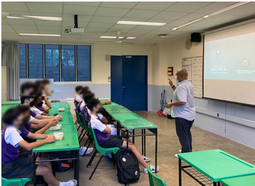
Anti-drug talk by CNB officer.

CNB offers an array of PDE programmes to engage school students. Teachers can mix and match the following options for students to learn more about the harms of drugs: