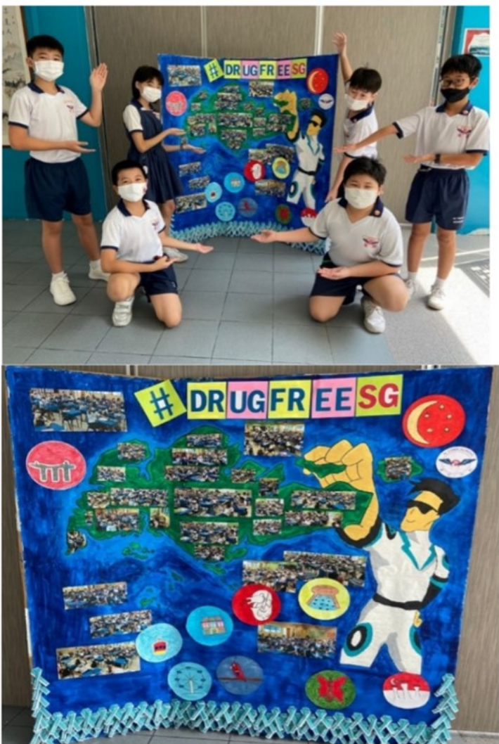
One of the winning entries of the Anti-Drug Montage Competition 2021, by Ai Tong School

The top 10 schools with the best Anti-Drug Montage and top 10 schools with the Highest Participation Rate will win a $500 cash prize each! We look forward to receiving your entries!