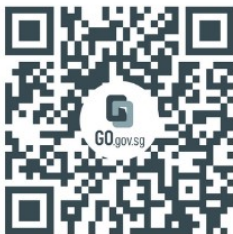
NCADA National Drug Perception Survey 2019/20 (NCADA Annual Report 2020)