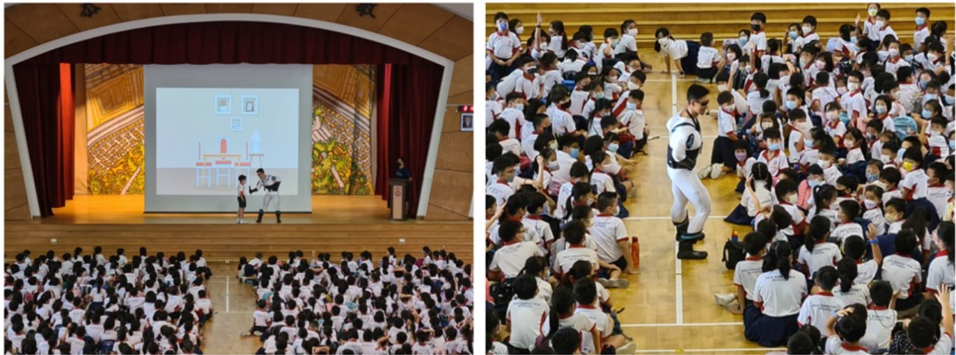
'Three's A Crowd', a skit for primary school students conducted at Red Swastika School

The interactive skits aim to educate and engage students on the dangers of drug abuse through relevant humour and themes relatable to youths. Interactive segments like a Q&A quiz are also incorporated to strengthen students' understanding of the anti-drug message. Three different skits tailored for students in primary school (6 to 12 years old), secondary school (12 to 16 years olds) and post-secondary institutions (youths older than 16 years old) are available for booking.