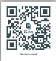
Scan here for the AR exhibition