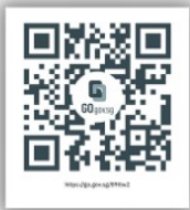
Scan here to find out about the A3 Network and different advocates schemes

Help us grow the A3 Network by telling your friends about us and the volunteering opportunities with CNB. Scan the QR codes for more information about the different schemes, or drop us an email at cnb_community_partnership@cnb.gov.sg