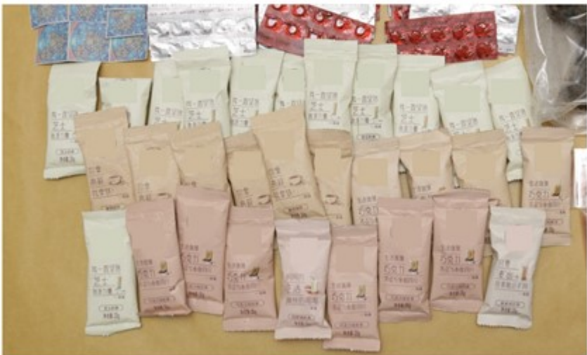
[Image: Tampered milk tea sachets.]

The concealment of drugs in milk tea sachets is just one of many ways in which drug trafficking syndicates hide their drugs. As advocates, we should be mindful and cautious when coming across items that seem to have been tampered with, especially when found in unusual places (e.g., packages at stairwells, dry risers, etc.). This is because such locations may be used as “drop-off” points for drug purchases.