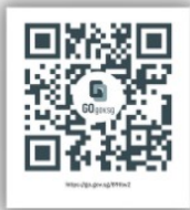
Scan here to find out about the A3 Network and different advocates schemes

Help us grow the A3 Network by telling your friends about us and the volunteering opportunities with CNB. Scan the QR codes for more information about the different schemes, or drop us an email at cnb_community_partnership@cnb.gov.sg