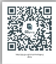
Scan here for the virtual heritage gallery

Drop us an email at CNB_Community_Partnership@cnb.gov.sg if you would like to unsubscribe or add your colleagues into our mailing list!