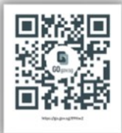
Scan here to find out about the A3 Network and different advocates schemes

Help us grow the A3 Network by telling your friends about us and the volunteering opportunities with CNB. Scan the QR codes for more information about the different schemes, or drop us an email at cnb_community_partnership@cnb.gov.sg