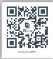
Scan here to find out about the A3 Network and different advocates schemes

Help us grow the A3 Network by telling your friends about us and the volunteering opportunities with CNB. Scan the QR codes for more information about the different schemes, or drop us an email at cnb_community_partnership@cnb.gov.sg