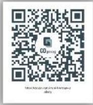
Scan here for the virtual heritage gallery

If you come across drugs, or what you suspect to be drugs, you should call CNB hotline at 1800-325-6666