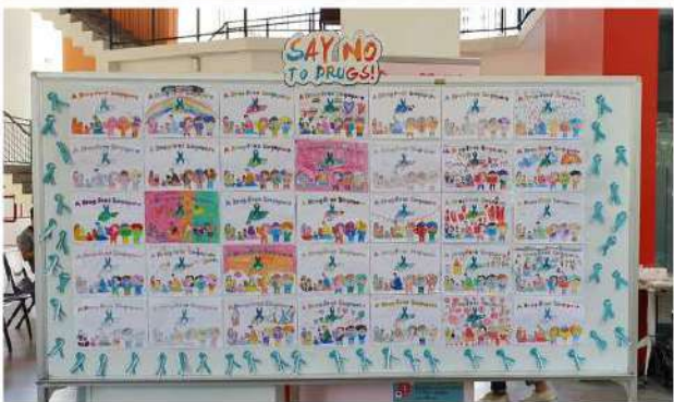
Taman Jurong DrugFreeSG Event

That's not the end! Continue to stay tuned to our social media handles @CNB.DrugFreeSG for highlights on our campaign activities and upcoming online contest!