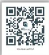
Scan here to find out about the A3 Network and different advocates schemes

Help us grow the A3 Network by telling your friends about us and the volunteering opportunities with CNB. Scan the QR codes for more information about the different schemes, or drop us an email at cnb_community_partnership@cnb.gov.sg