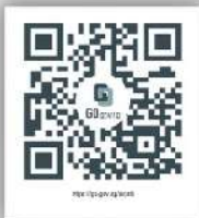
Scan here for the AR exhibition