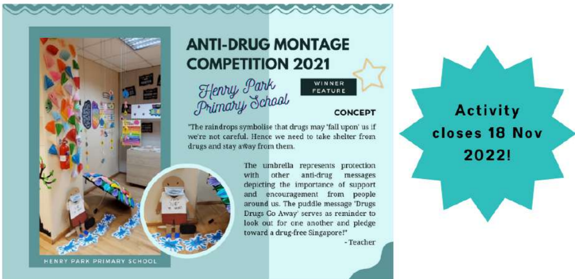
Entry from Henry Park Primary School for the Anti-Drug Montage Competition 2021

Did you know that the top 10 schools with the best Anti-Drug Montage and top 10 schools with the Highest Participation Rate will win a $500 cash prize each? Check out the entry from Henry Park Primary School last year, one of our winners in 2021!