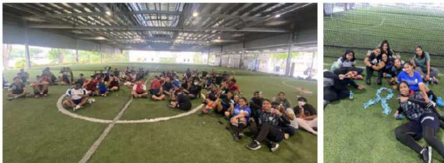
SINDA FC x BEN x ADAC - promoting a healthy lifestyle