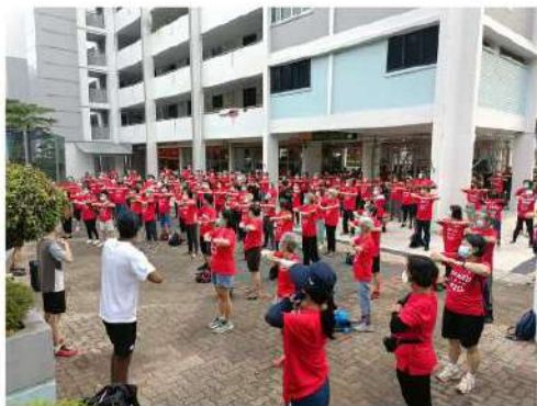
Teck Ghee CSC x Republic Poly - Community Walk