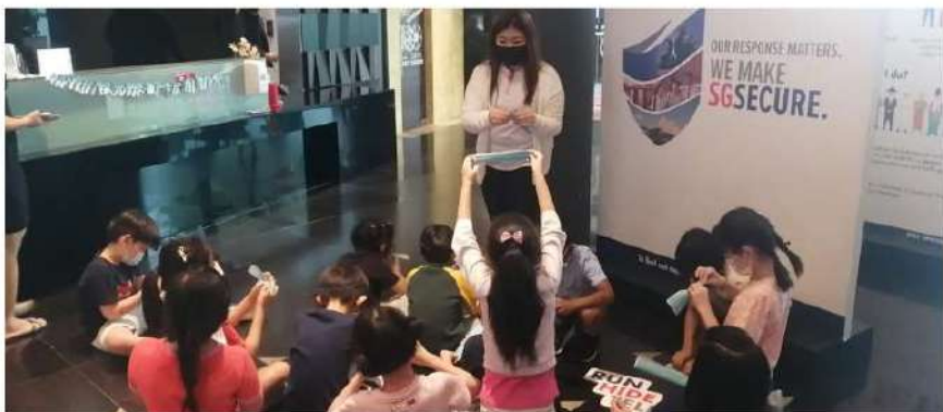
Collaboration with HTNS - anti-drug ribbon folding activity at HomeTeamNS Khatib, Balestier, Tampines and Bukit Batok