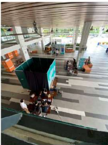
Singapore Poly Event - 'The Best Me, Is Drug-Free'