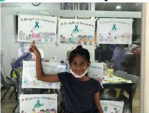
Collaboration with 13 community libraries - to inculcate anti-drug awareness and resilience in our young ones