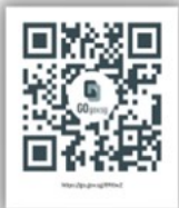
Scan here to find out about the A3 Network and different advocates schemes

Help us grow the A3 Network by telling your friends about us and the volunteering opportunities with CNB. Scan the QR codes for more information about the different schemes, or drop us an email at cnb_community_partnership@cnb.gov.sg