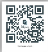
Scan here for the AR exhibition