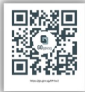
Scan here to find out about the A3 Network and different advocates schemes

Help us grow the A3 Network by telling your friends about us and the volunteering opportunities with CNB. Scan the QR codes for more information about the different schemes, or drop us an email at cnb_community_partnership@cnb.gov.sg